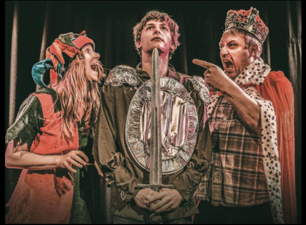
An early poster for Chainmail's Work-In-Progress performance at Colchester Arts Centre in 2020